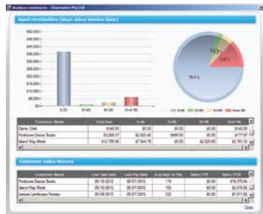
Quickly view your financial position