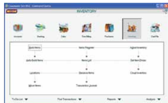
Easily manage your inventory